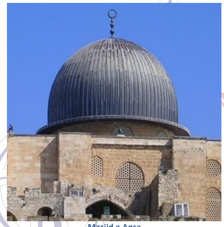
Masjid e Aqsa

This date marks a journey that has no parallel in human history and portrays the power of Allah that is beyond the horizons of human comprehension.